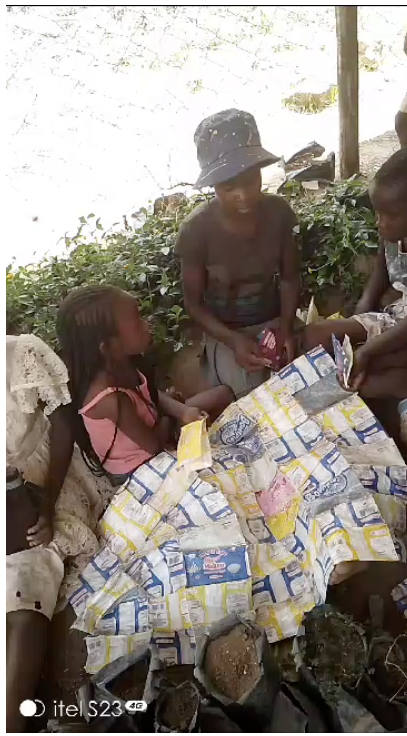
These children have sewn pieces of plastic together to make a mat for using in the house or the garden.