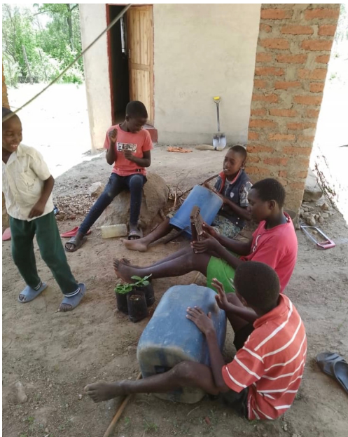
These boys are using buckets and big bottles as drums so they can play music together.