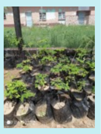
These are some of the seedlings growing in the nursery shade.